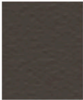
Burnished Slate CRINKLE