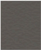
Charcoal Gray CRINKLE